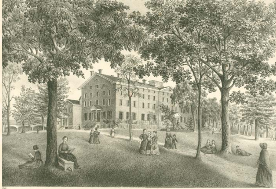
Westtown School Lithograph circa 1850

South West View of WEST-TOWN BOARDING SCHOOL. CHESTER CO. PENN. Instituted 1736, Opened 1739, Enlarged 1837.