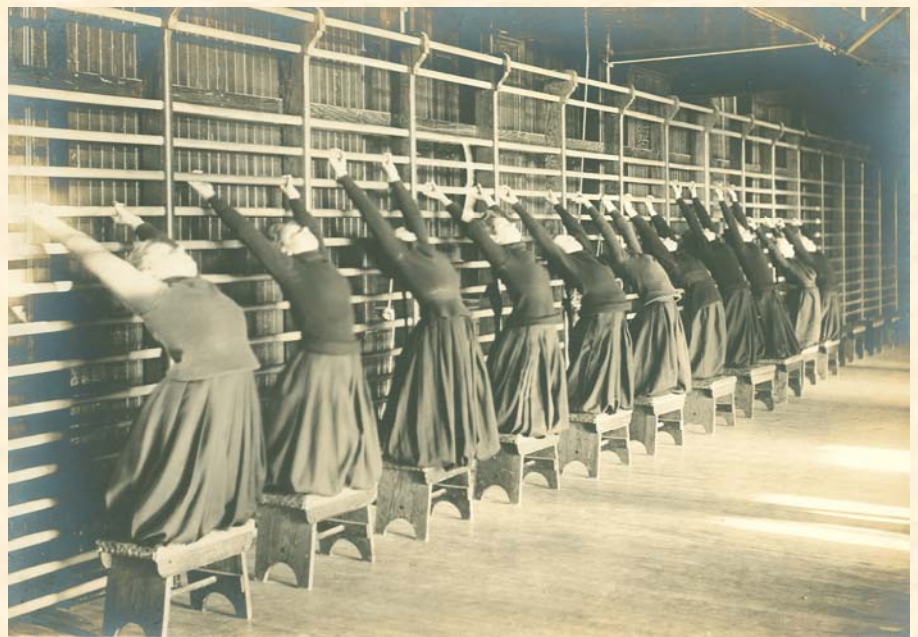
Westtown girls' gymnastic class circa 1900